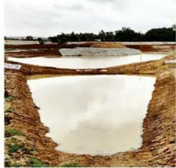
Before and after pictures of rejuvenation work at Vabasandra Lake at Bommasandra

said Agrahare. A clean-up drive was also taken up as part of World Earth Day, with 25 volunteers clearing up trash in the forests. So far, Saytrees has planted